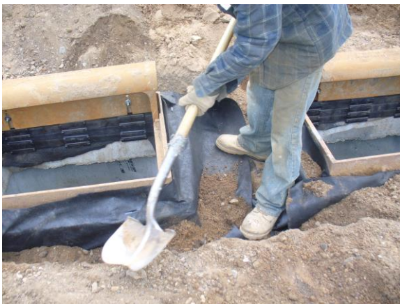
7. Backfill around structure.

6. If the specifying engineer requires a woven, unwoven or poly fabric wrap, it should be applied at this time. If used, the wrap should extend over casting flange and a minimum of 4" below top edge of concrete structure. If oversize manhole with top slab, wrap should rest a minimum of 6" out from rings and on top of slab.