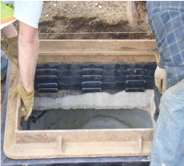
5. Place casting on rings.

* If a concrete collar is poured around catch basin rings and casting, filter fabric is not required.