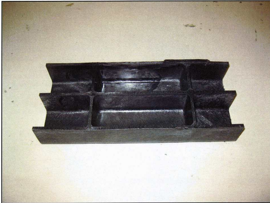
Figure 1 : Sample before durability testing